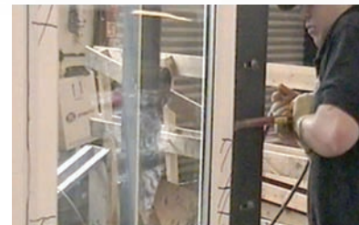
Rigorous testing was undertaken to assess the security of Climatec's products

SEE OVERLEAF FOR FULL SPECIFICATION FOR EACH PRODUCT MANUFACTURED TO SECURED BY DESIGN APPROVAL.