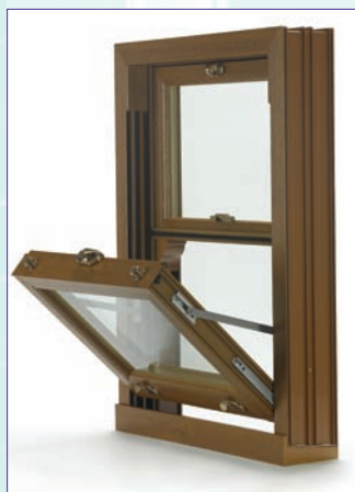
Both sashes tilt inwards to allow ease of cleaning

The traditional detailing of the REHAU Heritage Vertical Slider, together with the system's thermal, structural, weather and security performance allows for the replacement of old sash windows with a modern day equivalent.