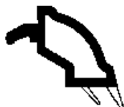
Ogee Bead for 28mm Units