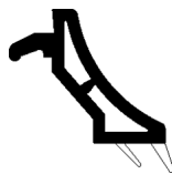
Scotia Bead for 24mm Units