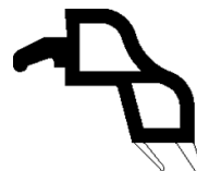
Ovolo Bead for 28mm Units

This bead is likely to be withdrawn soon.