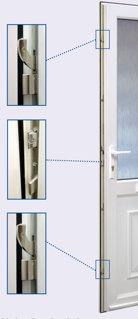
Lockable handles, shootbolts, anti-lift hook locks and hinge locking devices provide the ultimate security of window and door fastening