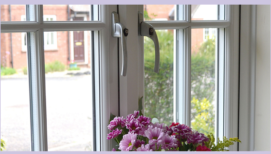
Elegance, innovative design and security are built into our systems at every stage