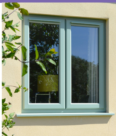
Colour shown: Chartwell Green

With 25 different coloured foils and a wide variety of RAL paint colours, you can order your windows and doors to complement your interior and exterior decor - for example, a clean white finish on the inside and either a woodgrain or colour finish on the outside.