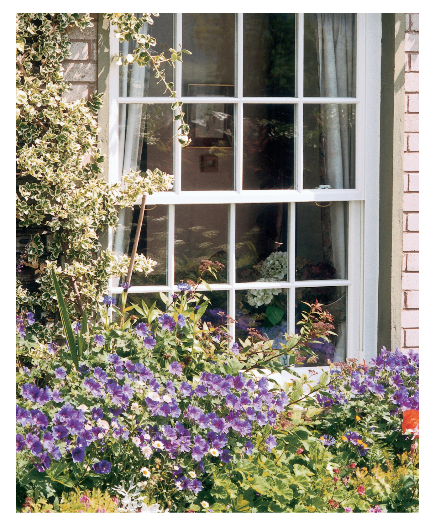
REHAU Heritage VERTICAL SLIDING WINDOWS