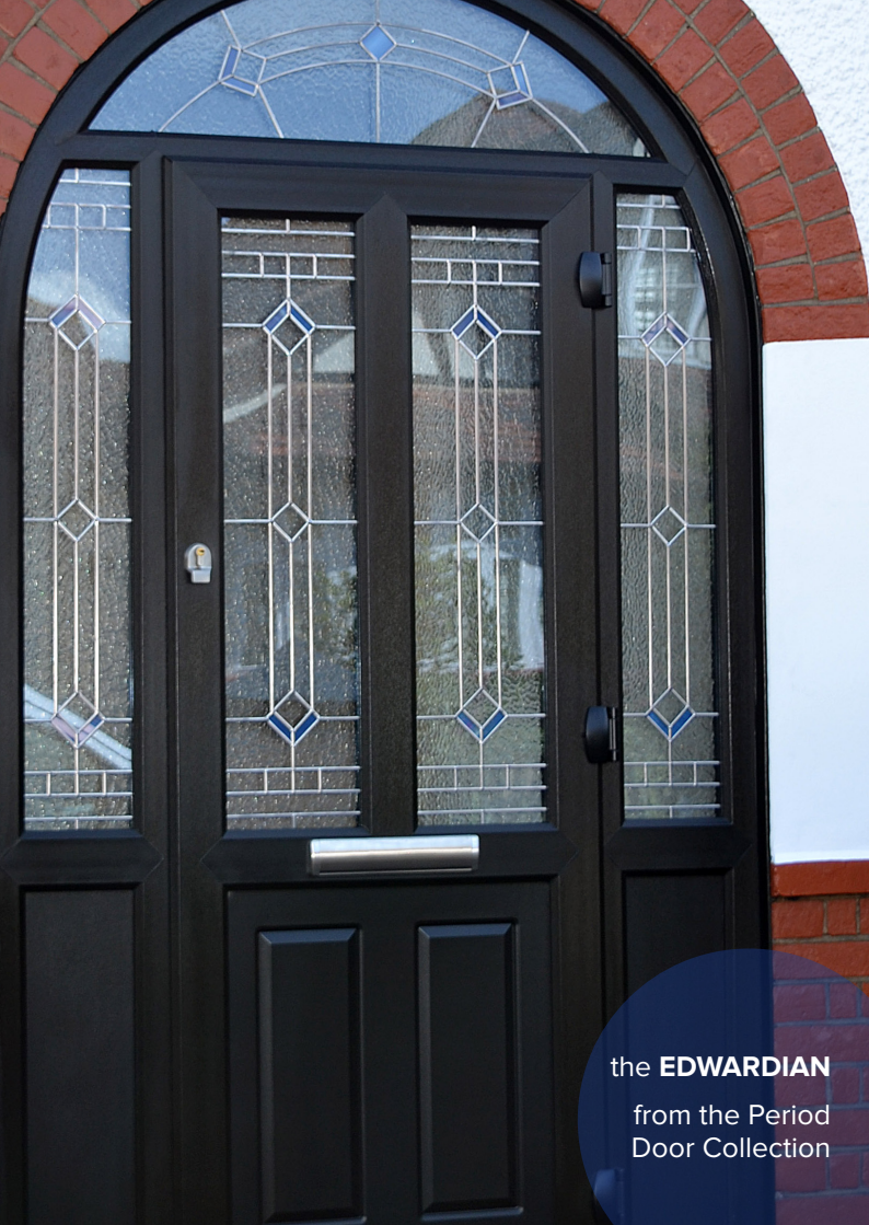
the EDWARDIAN from the Period Door Collection