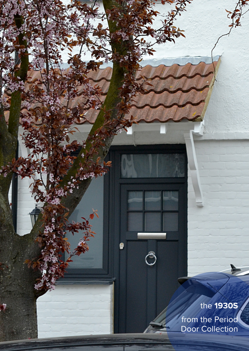
the 1930S from the Period Door Collection